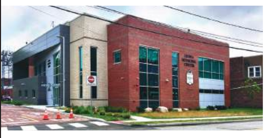
Leonia Police & Court