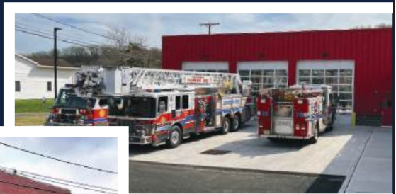
Holmdel Fire Department

We are proud to support the 200 Club of Bergen County.